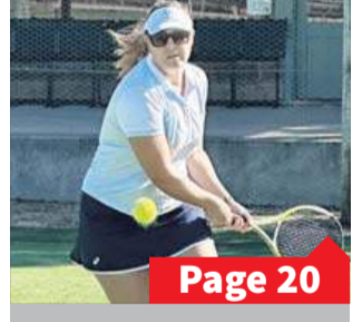
Page 20 New tennis league