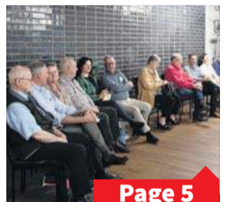
Page 5 Shire hosts forums