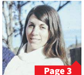
Page 3 Easey Street revisited