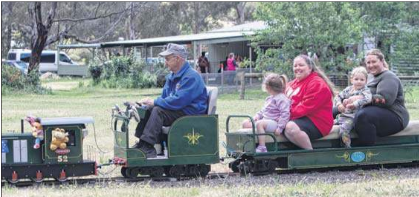
▲ POST-FLOOD DEBUT: Euroa Miniature Railway made its post-2022 flood debut after a long recovery effort.