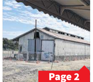
Page 2 Goodbye, Goods Shed