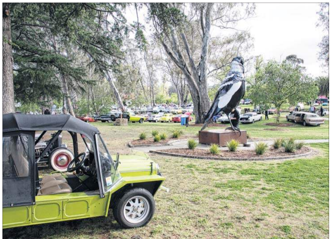
PARK MY CAR: Seven Creeks Park was overtaken by the Australian National Show & Shine Euroa on Sunday.

"We might have made it over the line, but it would have not been the show that it was today."