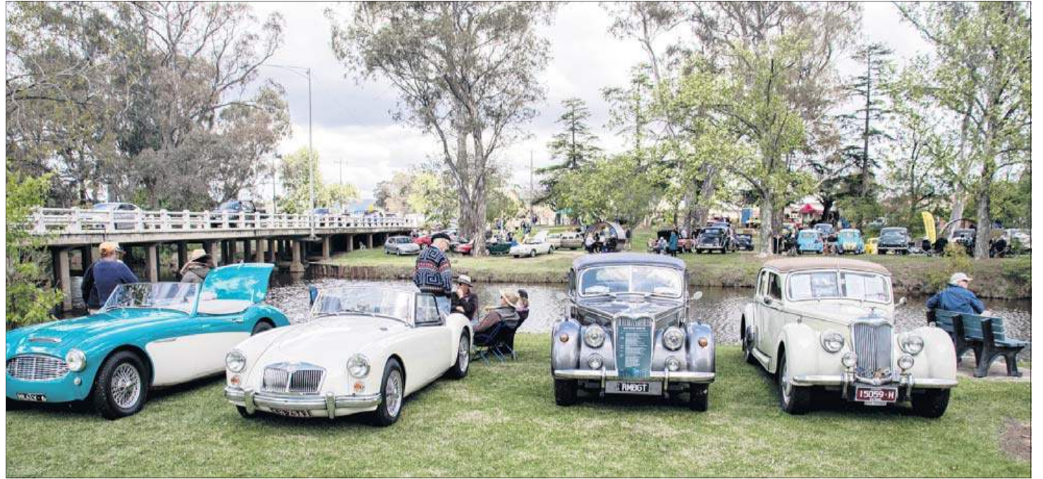
▲ PICTURESQUE: The Show & Shine took over Euroa's Seven Creeks Park.