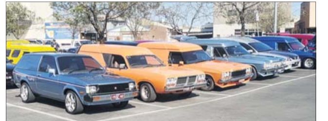
PARK MY PANEL VAN: Iconic Holden panel vans.