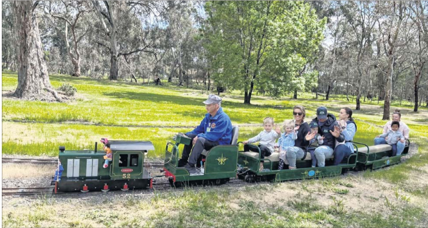
BACK IN ACTION: Don't miss the return of the Euroa Miniature Railway at this year's Show & Shine.