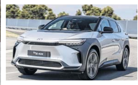
WHAT A FEELING: The Toyota BZ4X will be on display.