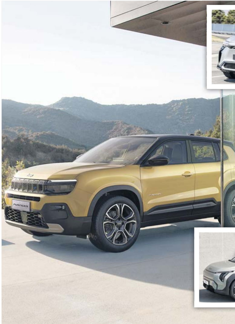
THE AVENGER: The Jeep Avenger is coming to Euroa.