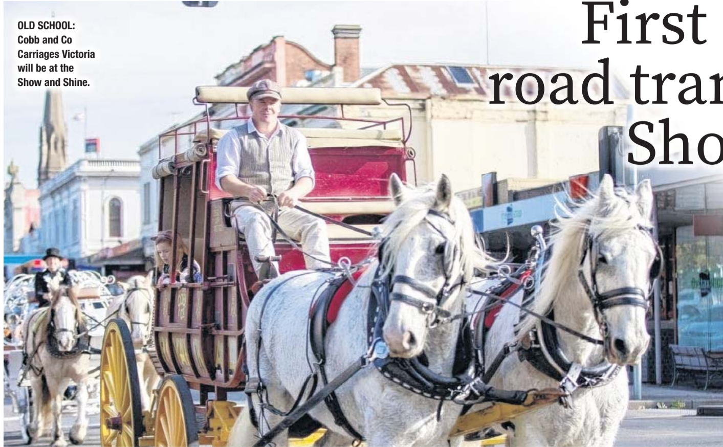
OLD SCHOOL: Cobb and Co Carriages Victoria will be at the Show and Shine.