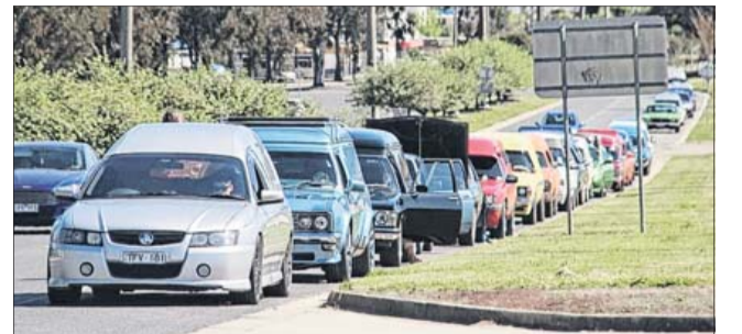
VANS LINE-UP: A panel van fan's dream.

"After winning the Best Club Display in 2019, we will be excited to see what everyone thinks of our display once again."