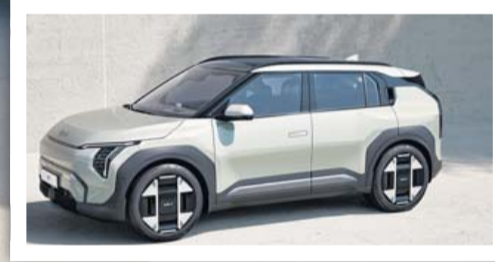
KIAS COMING: Kia electric vehicles will be up for perusal. Pictured is the Kia EV3.