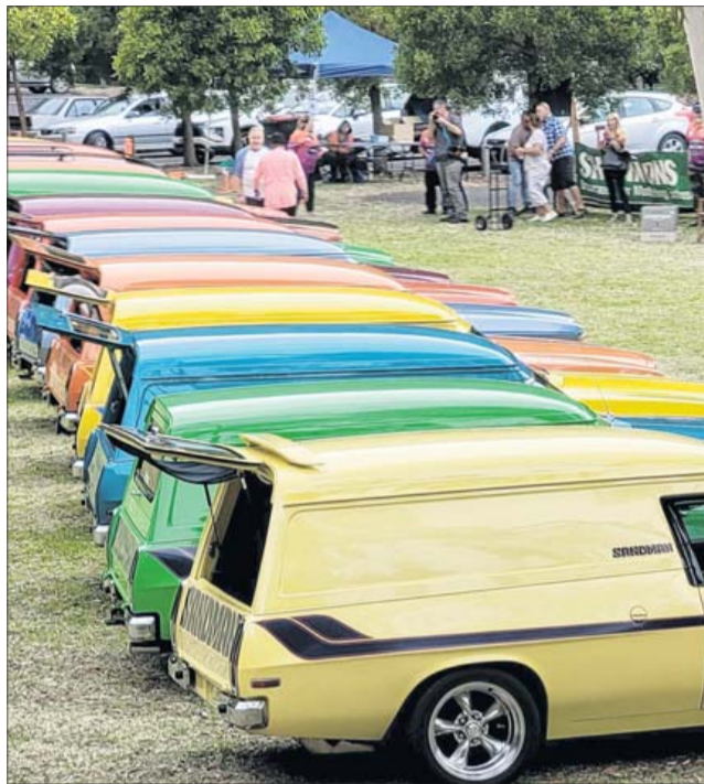
CLASSIC COLOURS: Showing off classic Sandman colours in Mt Gambier.

"It meant trips away to the surf and the country with all my mates, with vans giving us lots of freedom and no hotel fees.