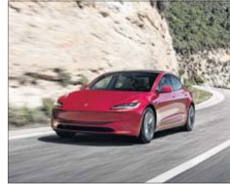
MUSK-SCENTED: The Tesla M3 will be at the show.